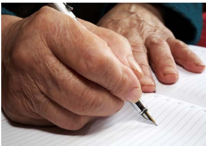
A diary or calendar is a great way to keep track of your warfarin usage.